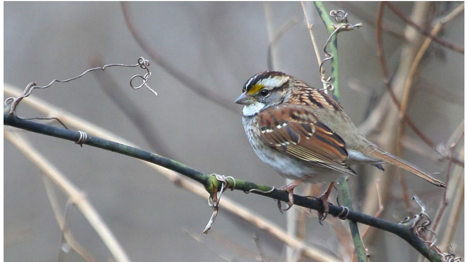
White-throated Sparrow.

The first warblers and shorebirds will be showing up here soon as well as the flycatchers, vireos, and more warblers later this month. We do not have any CCAS field trips planned currently, so come join us on Sunday mornings at Busey Woods at 7:30 am! 🕒