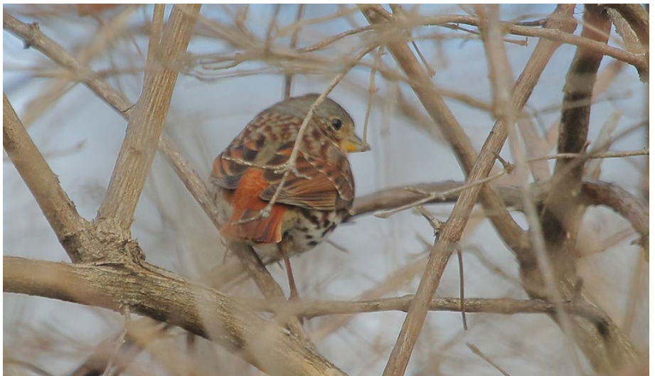
Fox Sparrow.