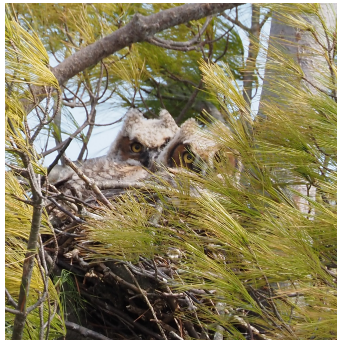
Owlets at the "second location" in 2021.