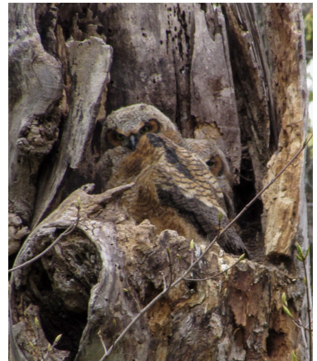
Great Horned Owl and owlets at Homer Lake Forest Preserve.