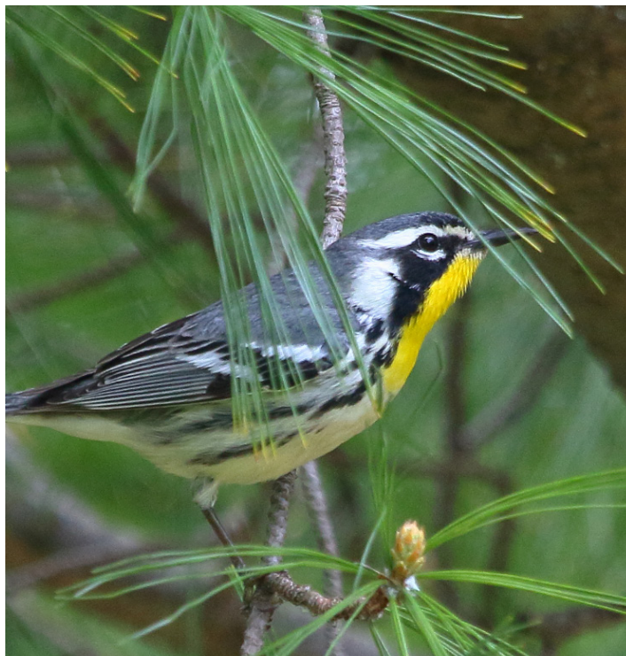
Yellow-throated Warbler.

www.champaigncountyaudubon.org/sunday-morning-birdwalks/